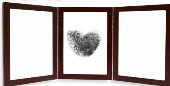
S68FV3 H3V 10X15