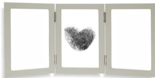
S68FV7 H3V 13X18