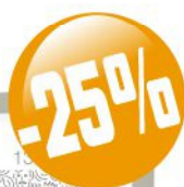
S68FV7 H3V 13X18