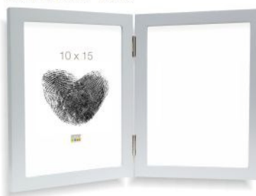
S68FD1 H2V 13X18