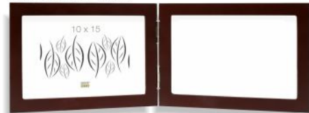
S68FV3 H2H 10X15