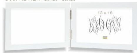
S68FK1 H2H 10X15 - 13X18