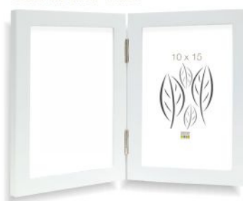
S68FK1 H2V 13X18