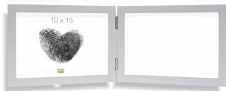
S68FD1 H2H 10X15